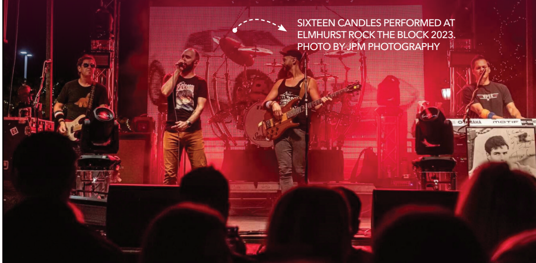
SIXTEEN CANDLES PERFORMED AT ELMHURST ROCK THE BLOCK 2023.

Tribute bands keep hits of the past and present decades alive. They can even repurpose that music into something more distinct, differentiating themselves from other bands. Make sure to check out upcoming performances to avoid missing out on an unforgettable experience and a trip down memory lane.